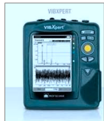
Industry accepted analysis equipment